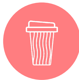
*8oz Takeaway cups/lids