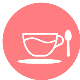
12oz Crockery Cup/Saucer/Teaspoon