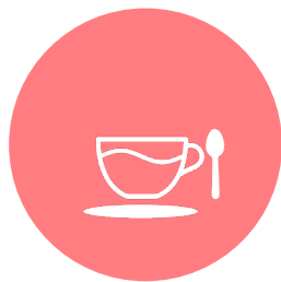
Double Espresso Cup/Saucer/Espresso Spoon