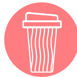
12oz Takeaway cups/lids