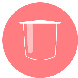
Costa Approved Capsules