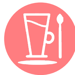
Latte Glass/Saucer/Long Handled Spoon