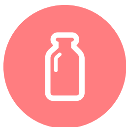
Milk Jug (as required)