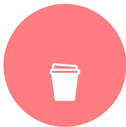
Espresso Takeaway cups/lids